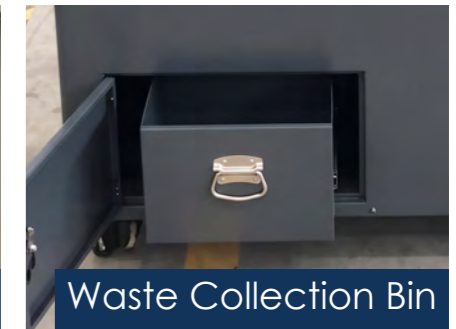
Waste Collection Bin