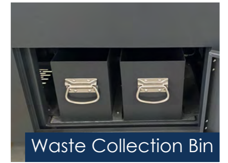
Waste Collection Bin

Shredding Particle Size 20mm* Random + 5mm* Random