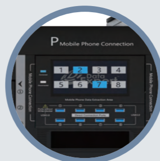
Phone Connection Panel

Supports multi-tasking of mobile extraction for high-demanding investigative needs.