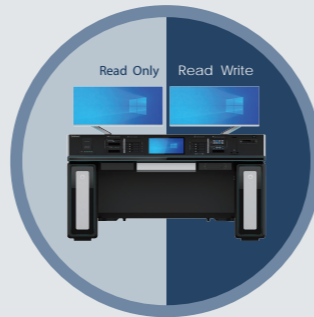
Forensically sound design

Allows customize the hardware to support several high-demand forensic software.