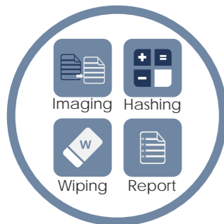
4 main functions of software