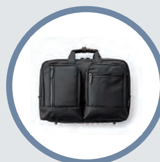
Dedicated carrying bag

The bag offers excellent protection for MZR-P, and its internal compartment is designed to conveniently store accessories.