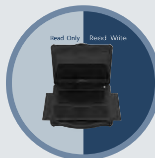
Forensically sound design

Allows customize the hardware to support several high-demand forensic software.