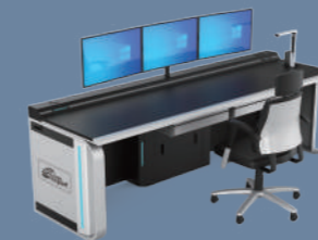
Evidence Preservation and Reception Workbench