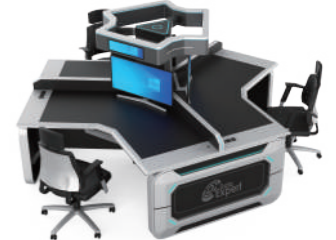
3-Person 120° Workbench