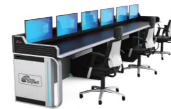
3-Person Long Workbench