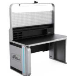
Disassembly and Repair Worktable

DE1904 L1400*W800*H750 (Desktop Panel: H1600)