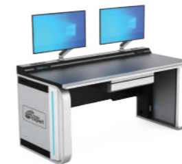
Examiner Work Desk